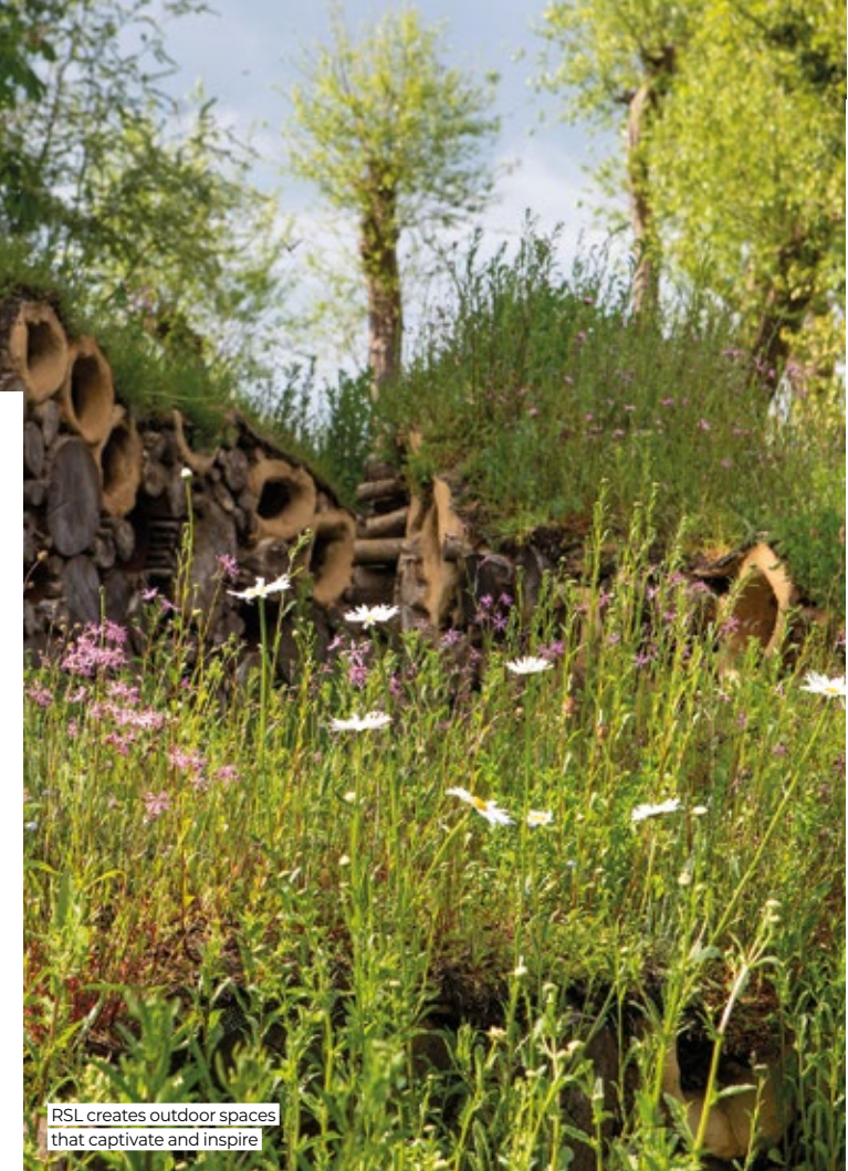
RSL creates outdoor spaces that captivate and inspire